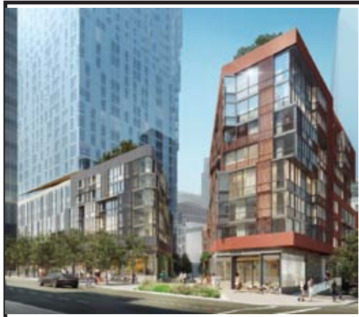
Block 8 400 Folsom Street 250 Fremont Street (OCII Sponsored Affordable project) Developer(s): Related/TNDC Market-Rate Units: 396 Affordable Units: 150 AMI: 70 inclusionary units @90%/ 80 OCII units @ 50% Total Units: 546 Construction Start: 2016 Completion: 2019