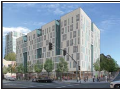
Block 11A 25 Essex Street Rene Cazenave Apartments Developer(s): BRIDGE/CHP Affordable Units: 120 AMI: 50% and below Total Units: 120 Construction Start: 2011 Completion: 2013