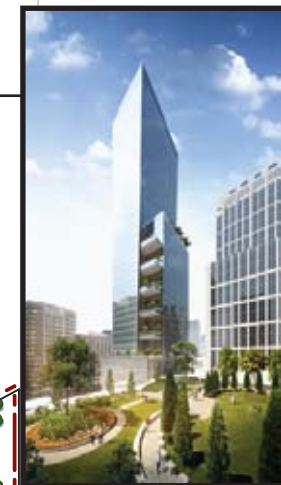
Block 5 250 Howard Street Park Tower Developer(s): Golub/ John Buck Office Sq. Ft.: 767,000 Construction Start: 2015 Completion: 2018