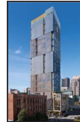
Block 9 500 Folsom Street Developer(s): Essex/ BRIDGE Market-Rate Units: 436 Affordable Units: 109 AMI: 50% and below Total Units: 545 Construction Start: 2016 Completion: 2019