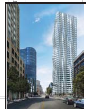
Block 1 (w/ 400' height) 160 Folsom Street Developer: Tishman Speyer Market-Rate Units: 235 Affordable Units: 156 AMI: 80-120% Total Units: 391 Construction Start: 2016 Completion: 2019