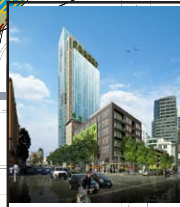
Block 6 299 Fremont Street/ 280 Beale Street (OCII Sponsored Affordable project) Developer: Golub/Mercy Market-Rate Units: 409 Affordable Units: 70 AMI: 50% and below Total Units: 391 Construction Start: 2016 Completion: 2019