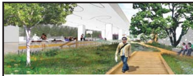
Under-Ramp Park Acres: 2.5 Construction Start: 2018