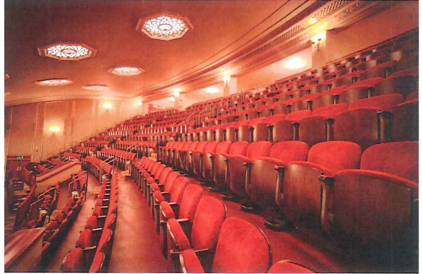
Replaced 1932 Opera House Balcony Seats in August 2015.