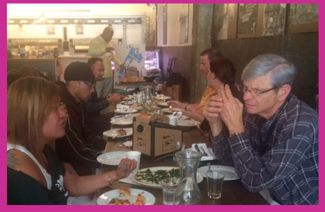
SRO Hotel Support