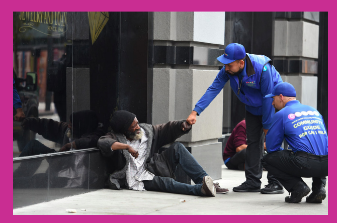
Mid-Market Business Association Safety Team