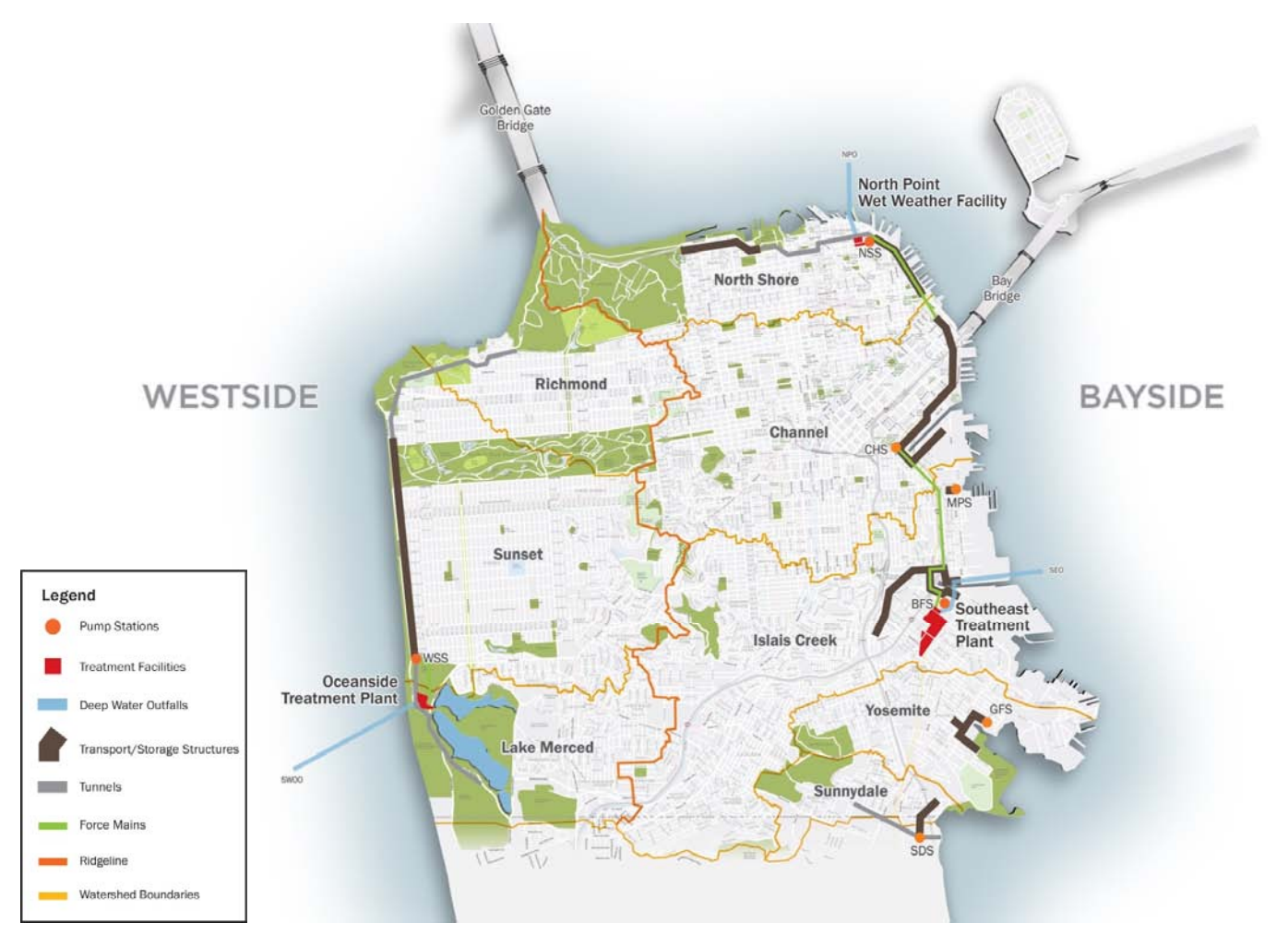
Figure 1-1 – SFPUC Wastewater Enterprise and Major Facilities (Not to Scale)

The SFPUC Wastewater Enterprise operates and maintains the City's combined sewer system which collects and treats both sewage and stormwater. The map above shows the geographical boundaries of the combined sewer system, major facilities of the combined sewer system and the ridge separating the Bayside from the Westside facilities.