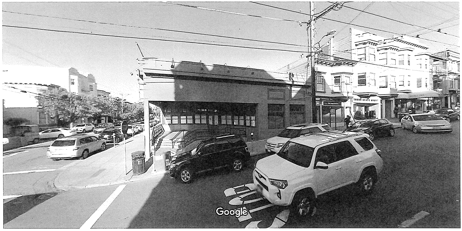
lmage capture: Apr 2017