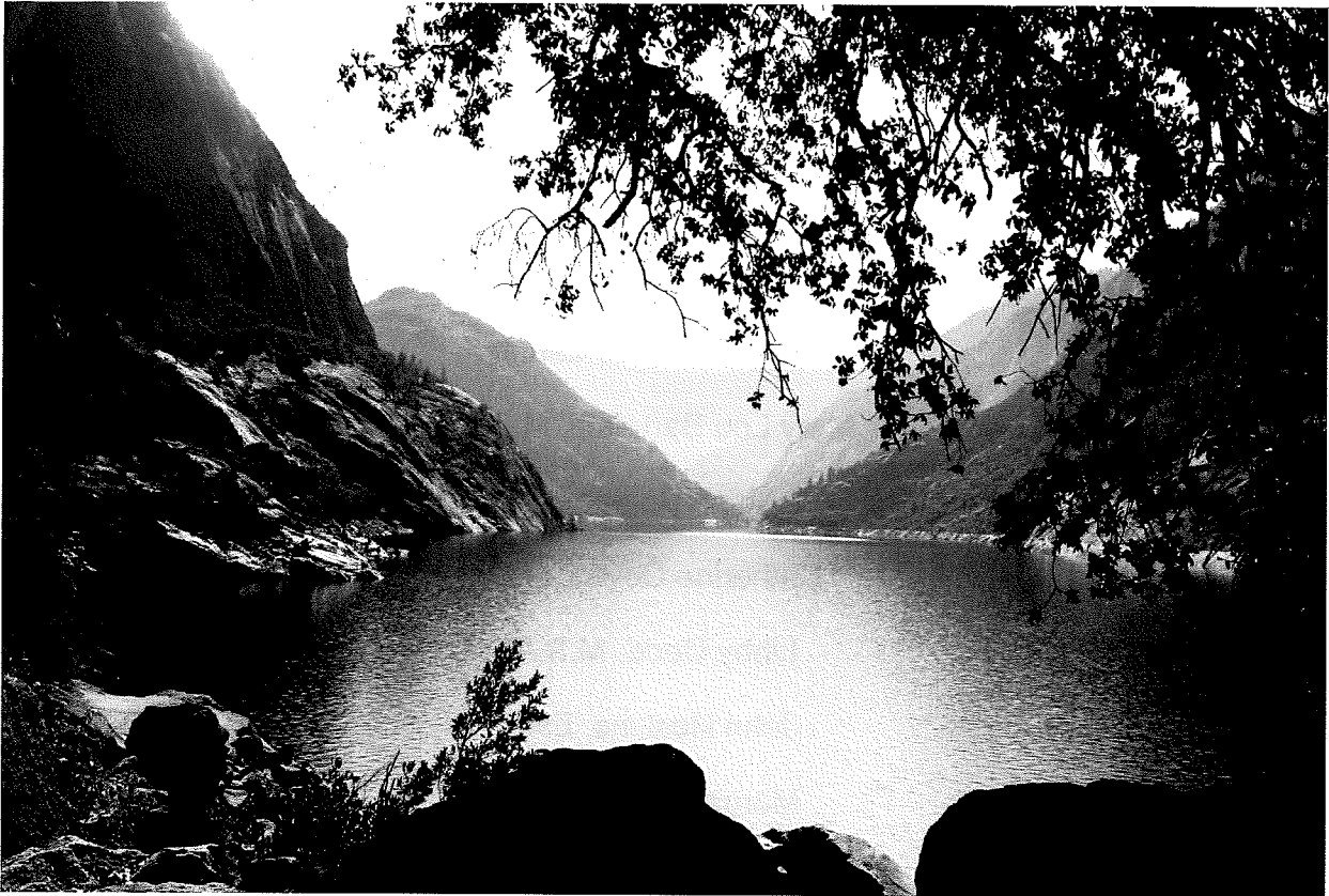
Hetch Hetchy Reservoir