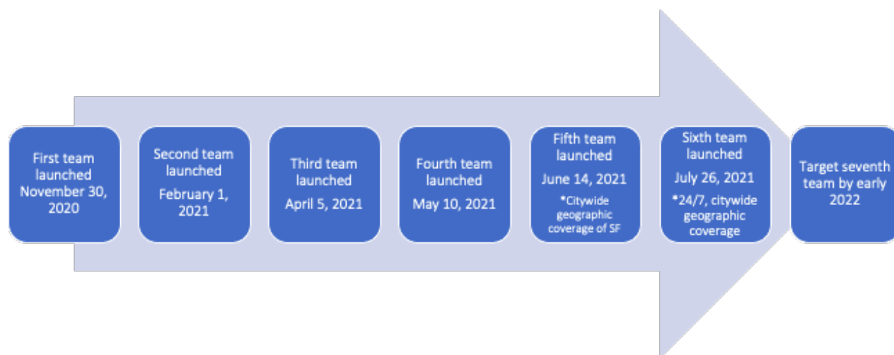
Figure 2: Street Crisis Response Team Implementation Timeline

The Street Crisis Response Team (SCRT) is a collaboration between the San Francisco Department of Public Health (DPH), the San Francisco Fire Department (SFFD), and the Department of Emergency Management (DEM) to provide the most appropriate clinical interventions and care coordination for people who experience behavioral health crises in public spaces in San Francisco. Each team includes one community paramedic, one behavioral health clinician (DPH-contracted with HealthRIGHT 360) and one behavioral health peer specialist (DPH contracted with RAMS, Inc.).