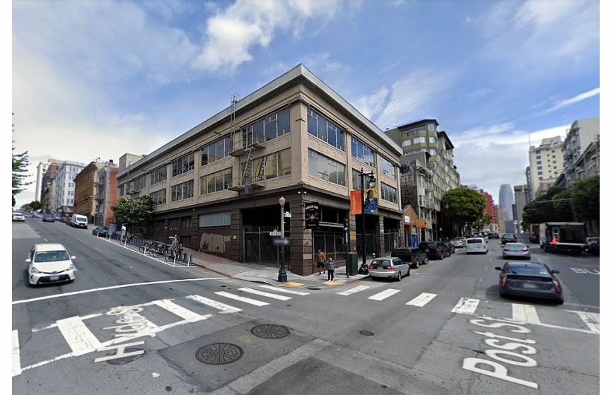
Lower Polk TAY Navigation Center at 888 Post Street.