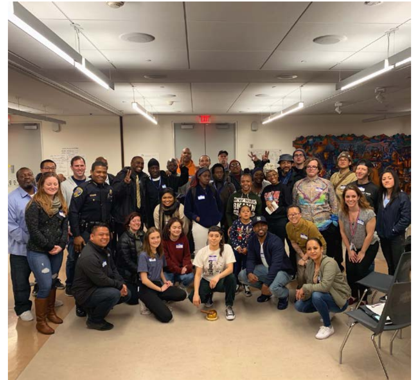
YC Youth Police Roundtable March 2019