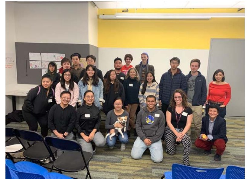
29-Sunset YC Town Hall Fall 2019