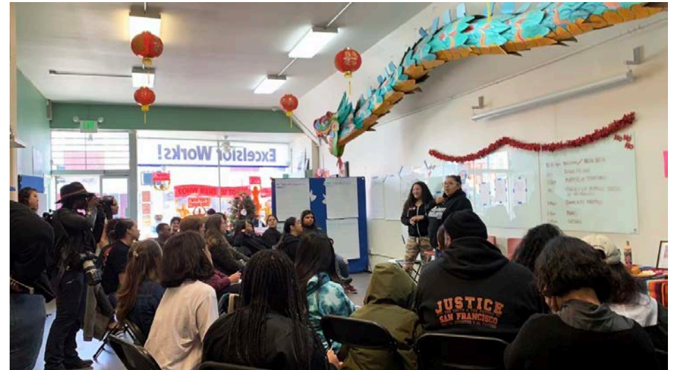
Youth Situation Town Hall Young Women's Freedom Center November 2019