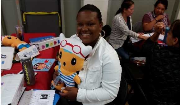
Head Start Educator Training