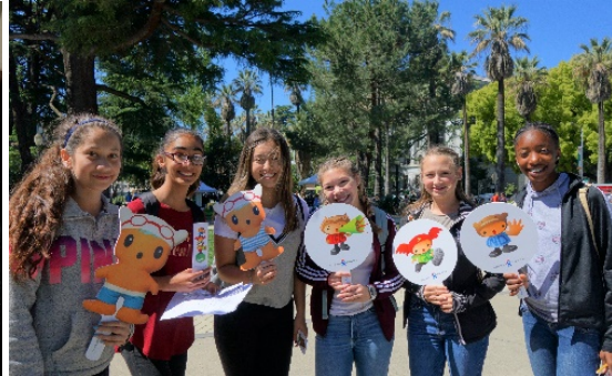
Kids Day at the Capital