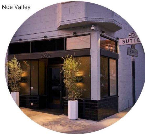
Anomaly, 2600 Sutter St, Lower Pacific Heights