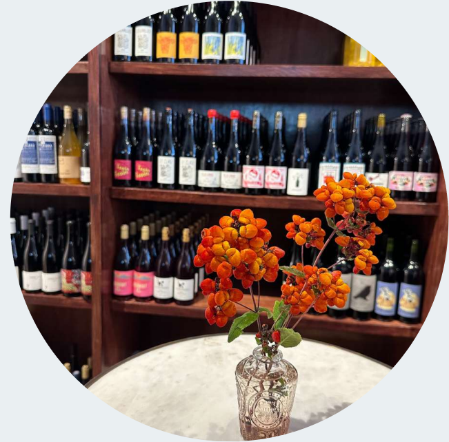
Tala Wine, located at 4625 Mission St in the Excelsior district, opened in May 2023 and benefitted from the First Year Free Program.

“When I first started my online wine club and shop, opening a physical location was a dream, but also a risk. First Year Free saved my business thousands of dollars while we were renovating our space and preparing to open. It helped give me an edge as Tala Wine got up and running.”