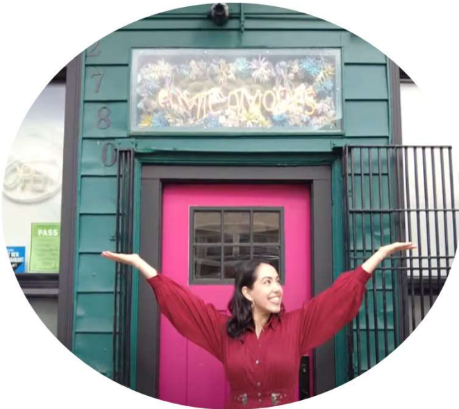
El Mil Amores, located at 2780 21st St. In the Mission District, saved $11,000 in waived fee through the First Year Free Program.