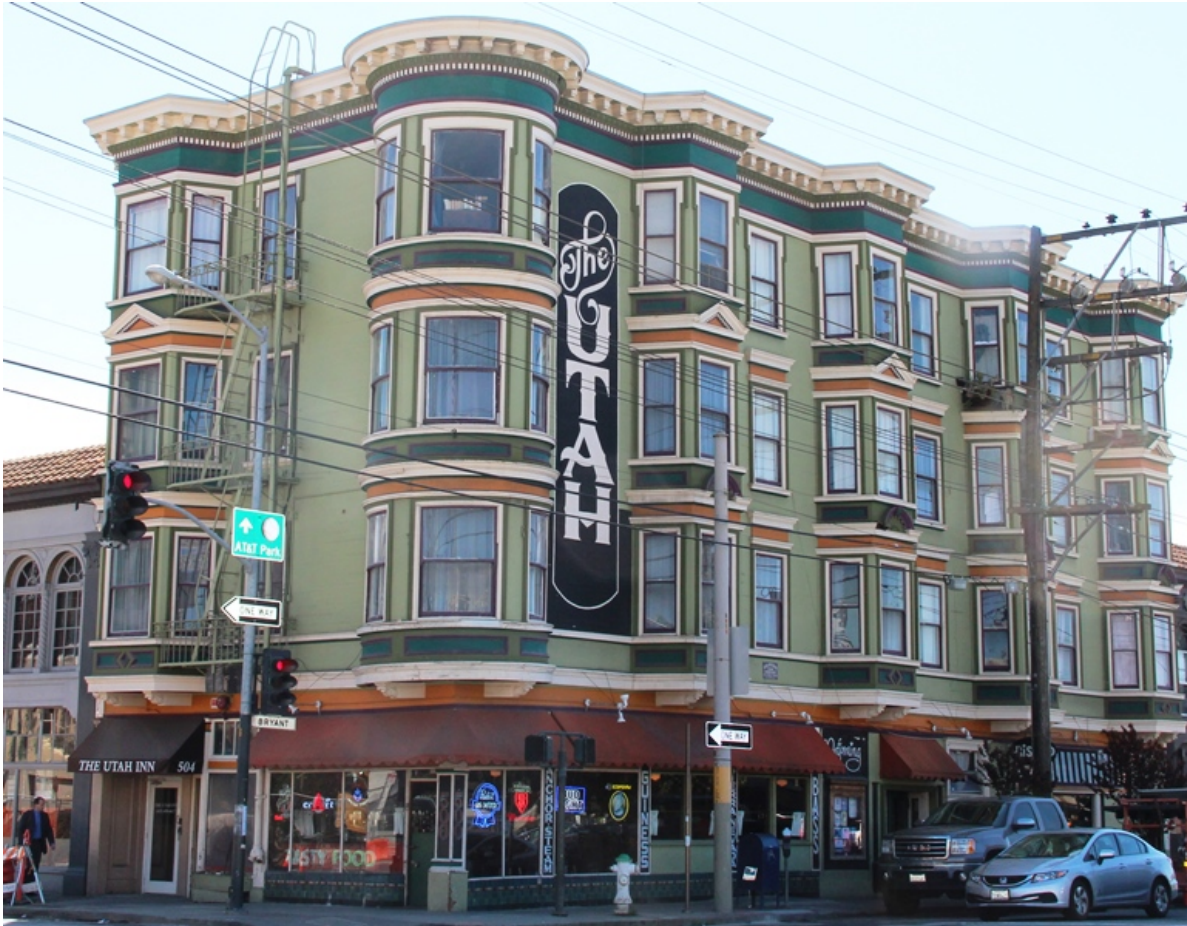
500-504 FOURTH STREET HOTEL UTAH

Article 10 Landmark Designation Case Number 2017-004129DES Hotel Utah 500-504 Fourth Street