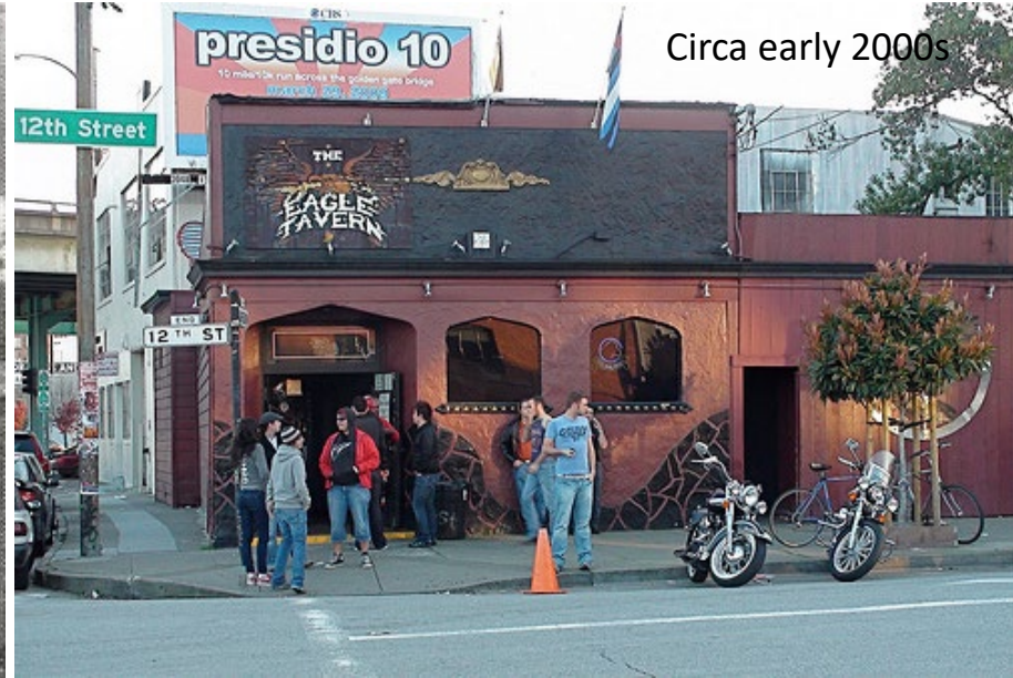
Circa early 2000s