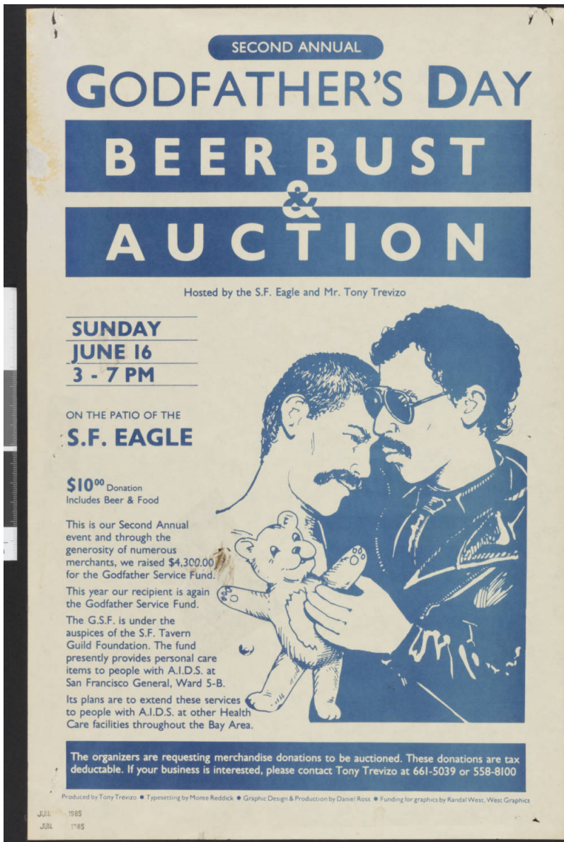
1985 AIDS fundraiser flyer.