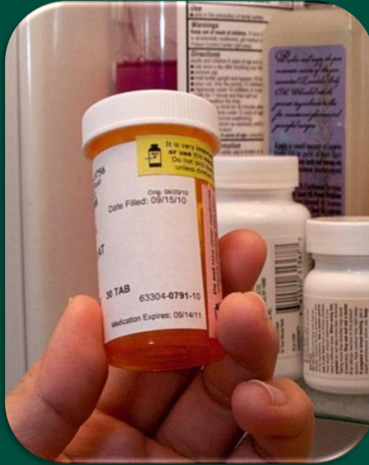
Prescription Drug Misuse