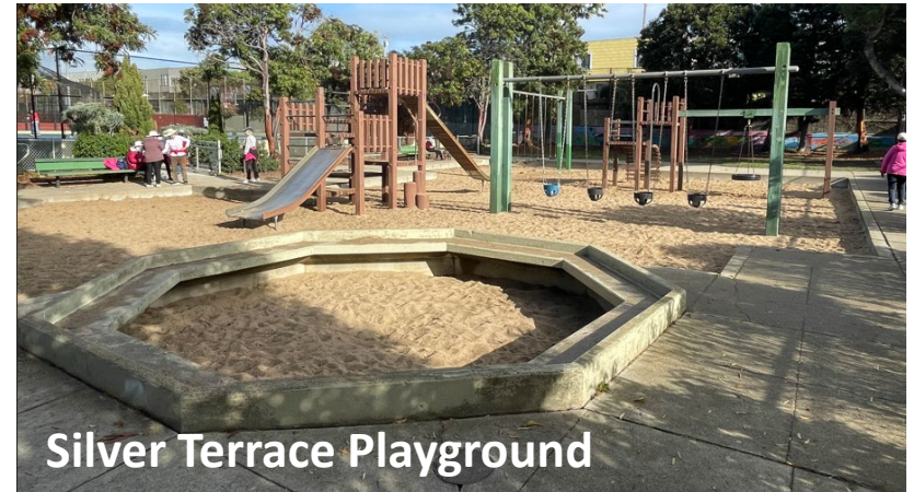
Silver Terrace Playground

Time savings: 30% faster from 1 year and 2 months to less than 1 year (~8 months) Cost savings: ~30% from ~$390K to $270K