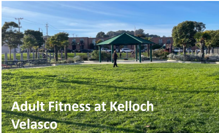
Adult Fitness at Kelloch Velasco

Time savings: 30% faster from 1 year and 2 months to less than 1 year (~8 months) Cost savings: ~30% from ~$390K to $270K