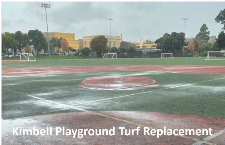
Kimbell Playground Turf Replacement

Time Savings: 30% from 2 years to just over 1 year Cost Savings: ~25% from $2.6M to just under $2M