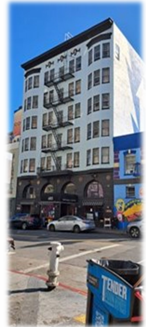
Photo: Exterior of Ellis Semi-Congregate Shelter