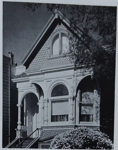
124 Delmar Street

umns of the portico are repeated in the window of this cottage, whose surface ripples with fishscale shingles.