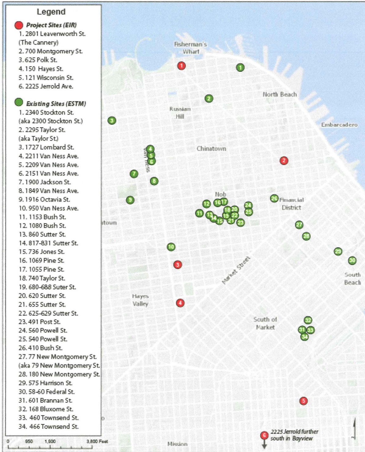
AAU Project & Existing Sites - Figure 1