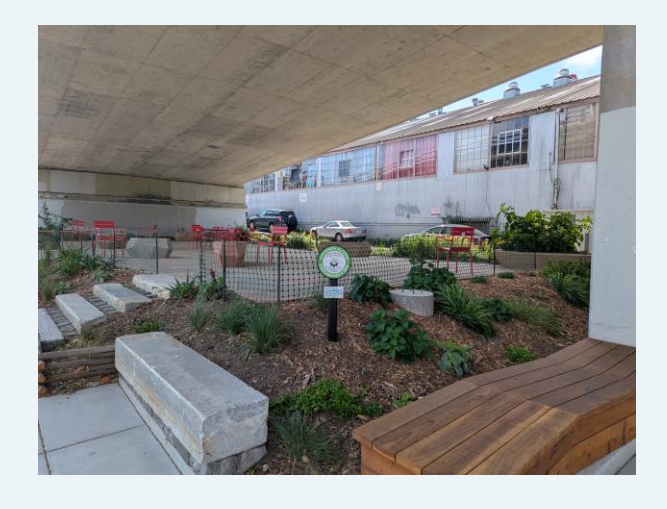
20<sup>th</sup>/Minnesota streets (after)