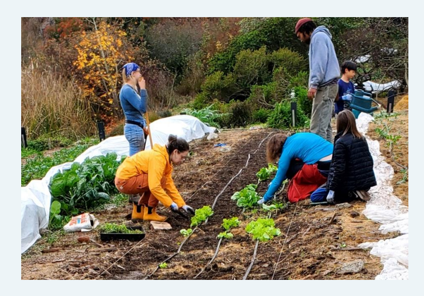
Beet-bed planting at Alemany Farm

Approve the revised rules and regulations to the Neighborhood Beautification and Graffiti Clean-up Fund.