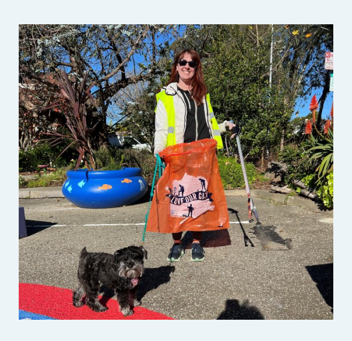
Friends of Lakeside Village volunteer day