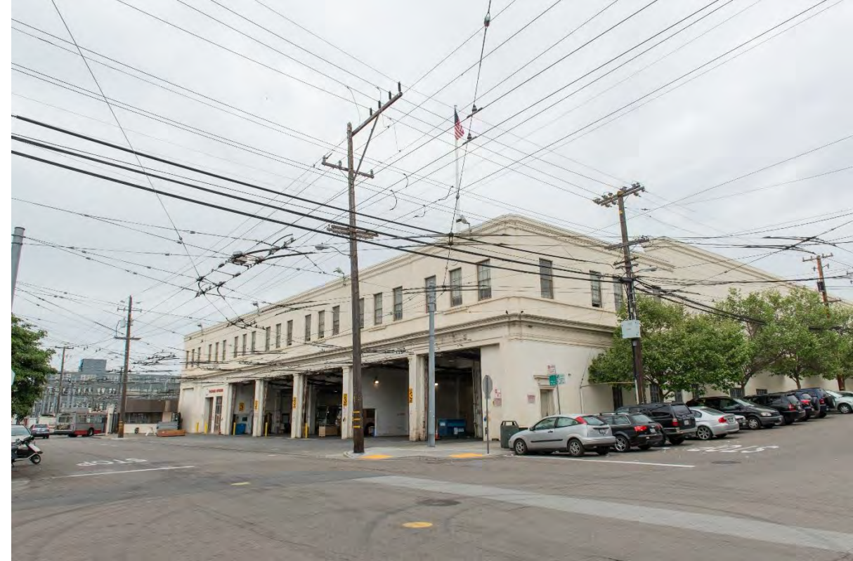
The Potrero Yard is more than a century old and long past its lifespan.