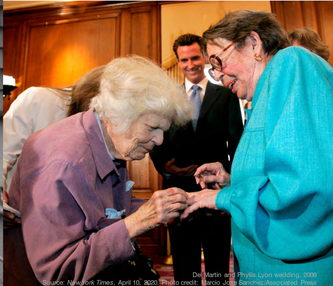
Del Martin and Phyllis Lyon wedding, 2008 Source: New York Times, April 10, 2020.