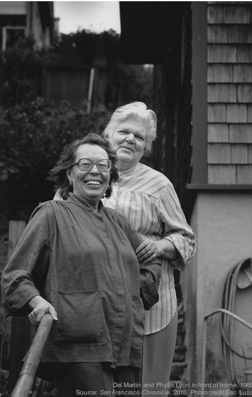
Del Martin and Phyllis Lyon in front of home, 1989

-HOUSE SPEAKER NANCY PELOSI, REMARKS FOLLOWING DEL MARTIN'S DEATH IN 2008