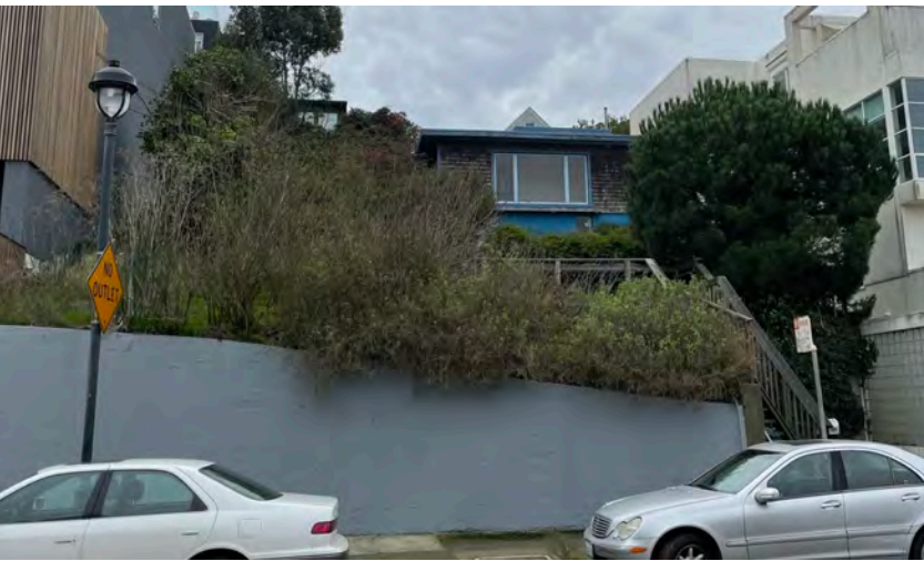
649-651 DUNCAN STREET, 2020