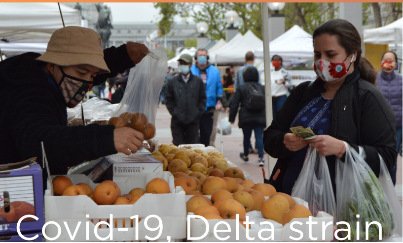
Covid-19, Delta strain

The pandemic remained an ongoing and unpredictable crisis. Our nation, City and neighborhood have taken impressive steps forward since the vaccine became available; but it is hard to know what challenges still lie ahead.