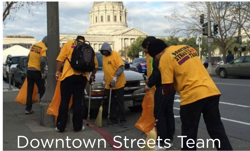
Downtown Streets Team