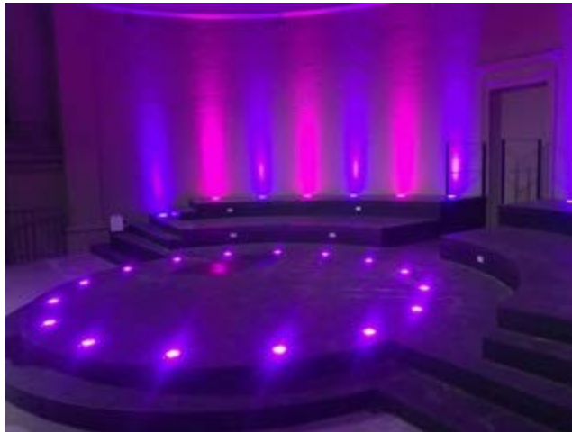
(February 12, 2021)

Finally, Parks and Rec have allocated a large budget for new lighting without saying where it's going. Please leave the DeYoung and Academy of Sciences low light. There is no lighting on the Tea Gardens, please leave it that way.