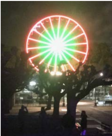
One Massive STROBE LIGHT (2/12/2021)

Strobe lights produce shadows intolerable to owls and other birds. Motion activated strobe lights are sold in pet stores to protect your backyard pets from owls. The negative impact to wildlife of this massive strobe light cannot be left unassessed for 4 more years.