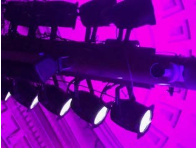
(February 12, 2021)

Parks and Rec has also permanently installed 26 robotically controlled strobe lights and a disco floor onto the Music Concourse Bandshell.