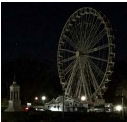
Lights out at sunset (February 20 2021)