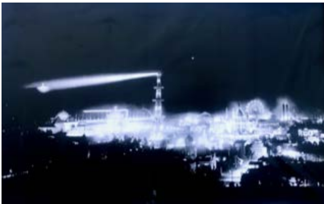
official photo of the 1894 Midwinter's Fair

John McLaren “fought tooth and nail” against the 1894 Midwinters Fair with it's theme of “Illumination”, stating "the damage to the natural setting would take decades to reverse"