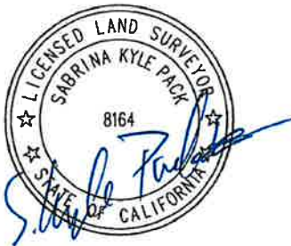
EXHIBIT A-1 ILLUSTRATIVE PLAT TO ACCOMPANY LEGAL DESCRIPTION

WEST HARNEY WAY LOTS J AND X, FINAL MAP NO. 12681 CITY AND COUNTY OF SAN FRANCISCO, CALIFORNIA MAY 26, 2026