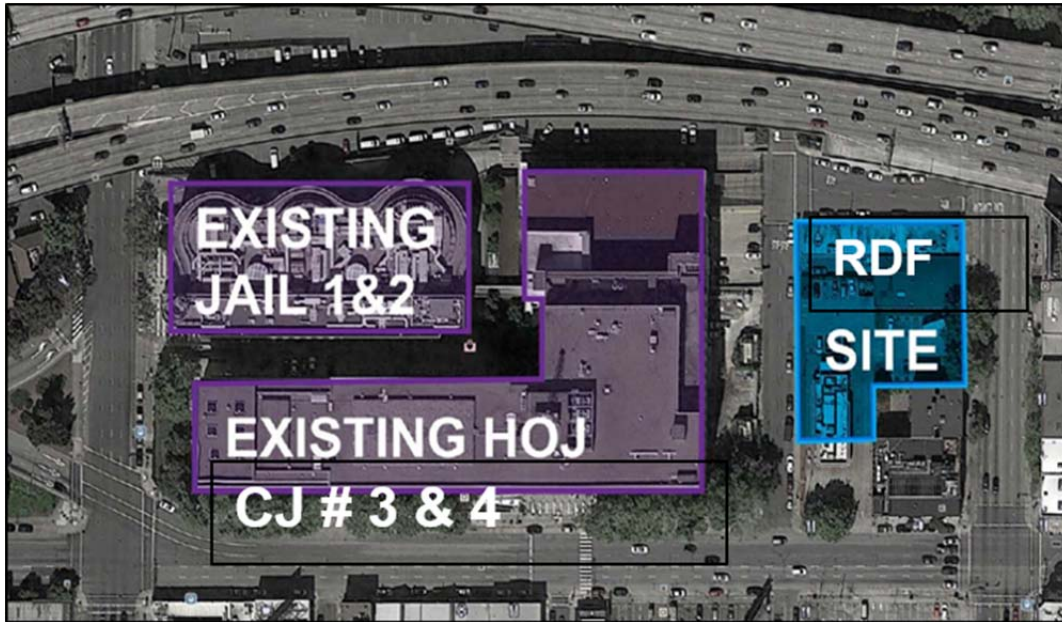
Exhibit: Hall of Justice and New Jail Facility Site Map

The City’s Real Estate Division is proposing to purchase four properties located at 814-820 Bryant Street, 444 6 th Street, 450 6 th Street and 470 6 th Street, adjacent to the HOJ to construct the replacement jail, as shown in the Exhibit below.