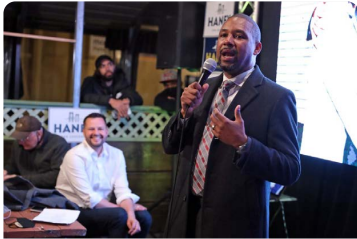
San Francisco considers reparations proposal to give $5 million per Black person foxnews.com