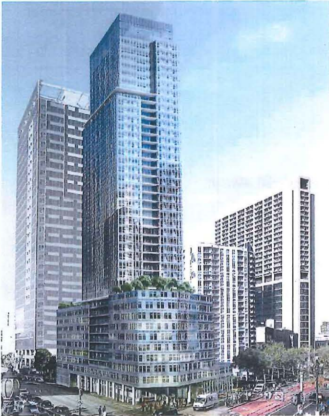
*Hypothetical rendering as redeveloped