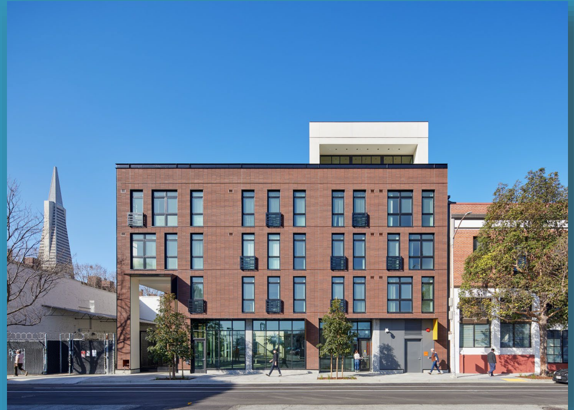
735 Davis Street