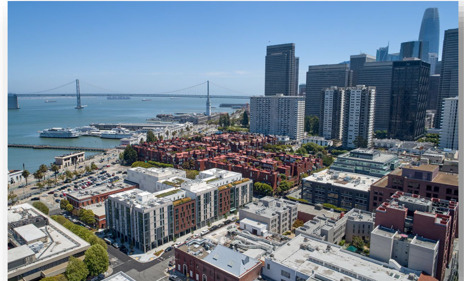
Broadway Cove

Continued Commitment to Senior Projects in New Construction Pipeline