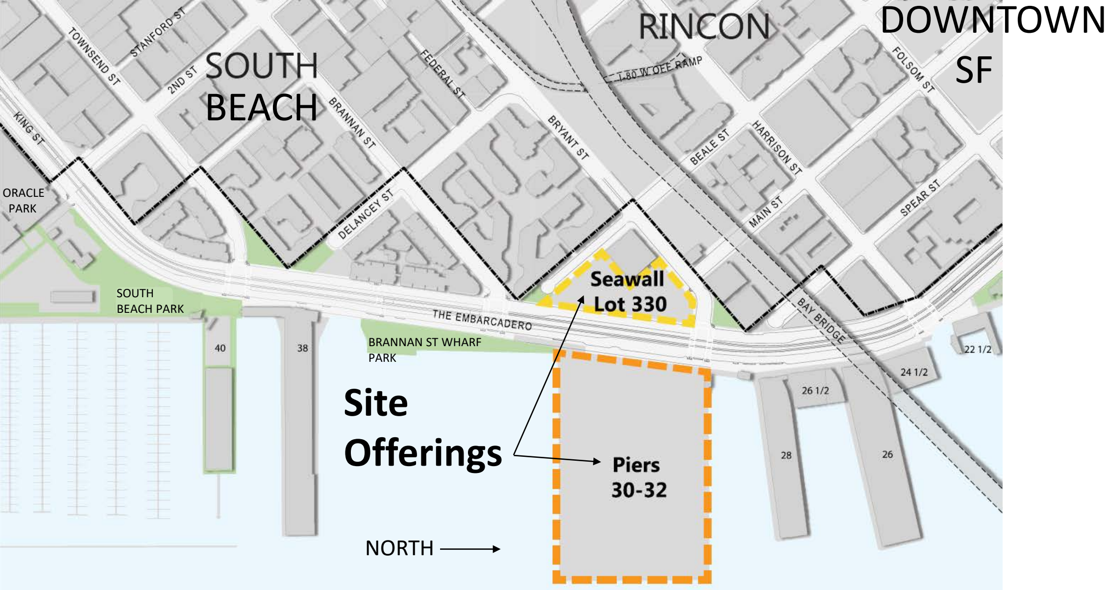
EXHIBIT 2: Piers 30-32 and Seawall Lot 330 Site Location and Setting