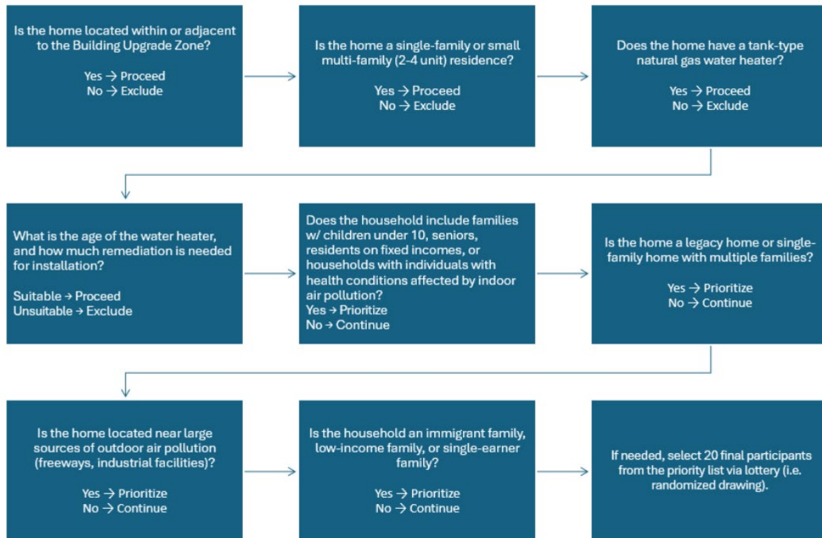
Initial Subscriber Screening Graphic 1. Screening Flow Diagram

After the screening stage, the Team will assess whether the project is ready to proceed with HPWH installation and insulation/weatherization upgrades. If additional home remediation is needed to prepare for these upgrades, the Team will conduct further evaluation before moving forward.