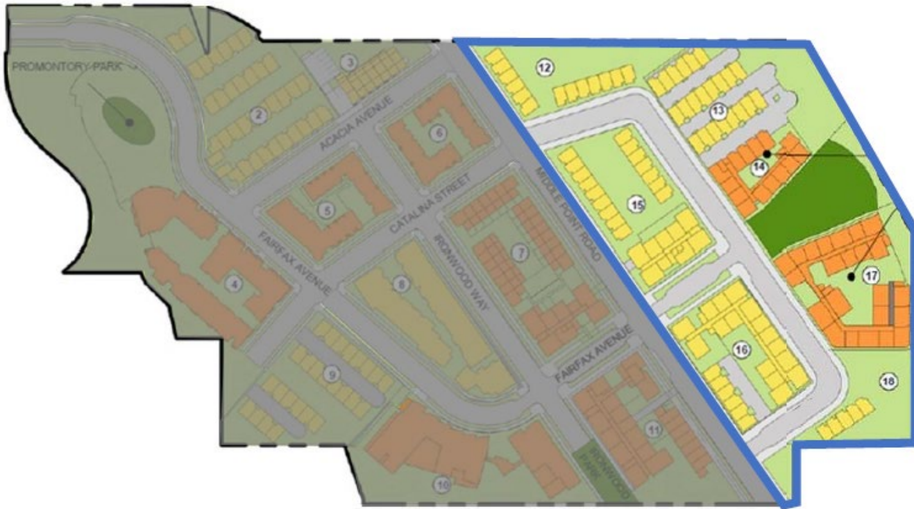
HUNTERSVIEW SITE PLAN – PHASE 3 VERTICAL BUILDINGS IN ORANGE