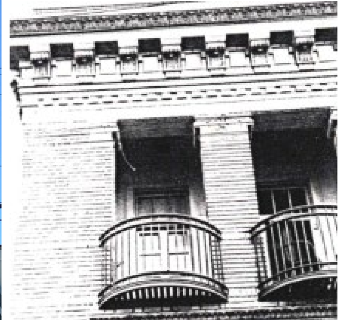
SF Fire Station No. 44, original Girard Street windows, circa 1994