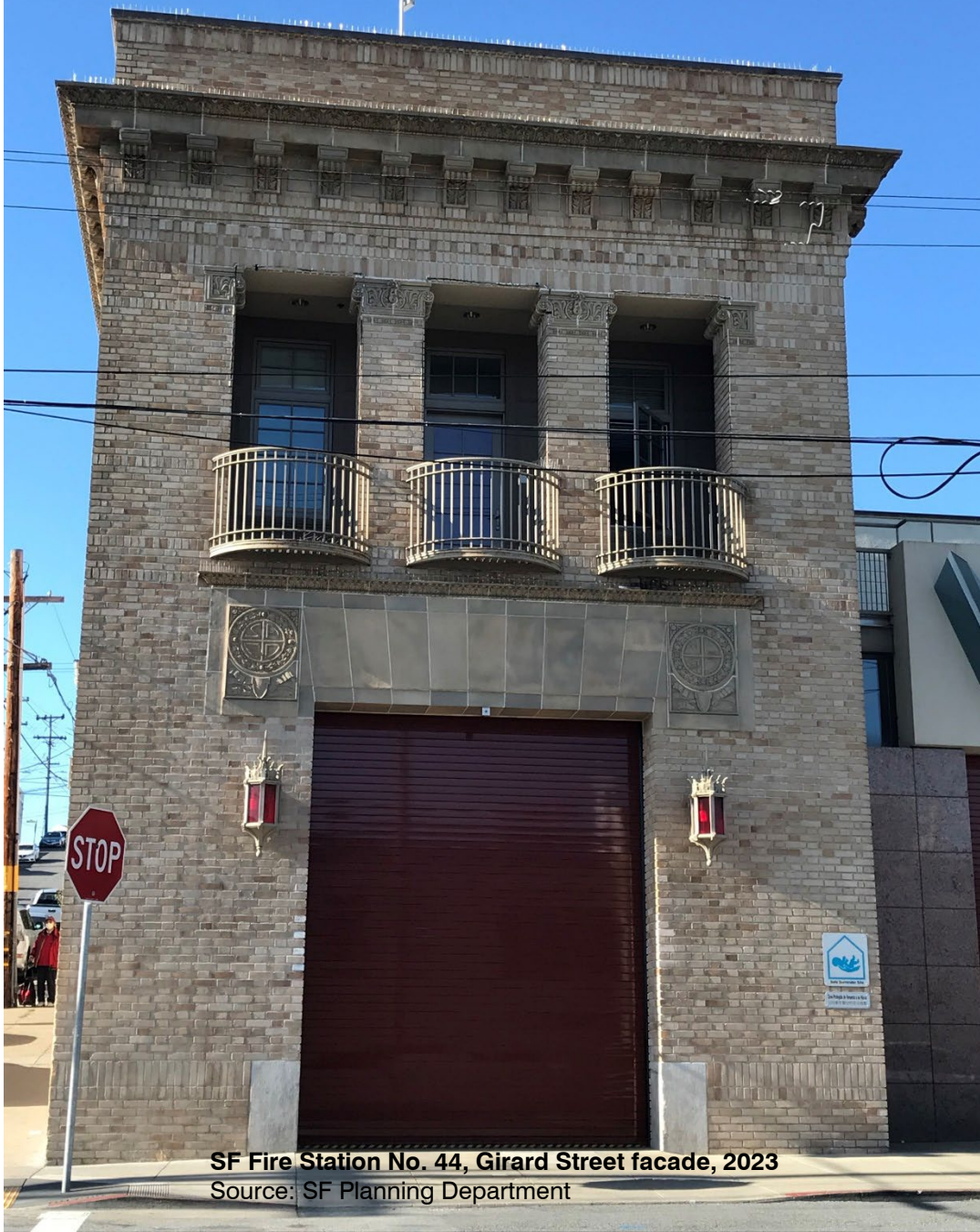
SF Fire Station No. 44, Girard Street facade, 2023