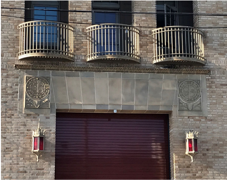
SF Fire Station No. 44, Girard Street facade details, 2023