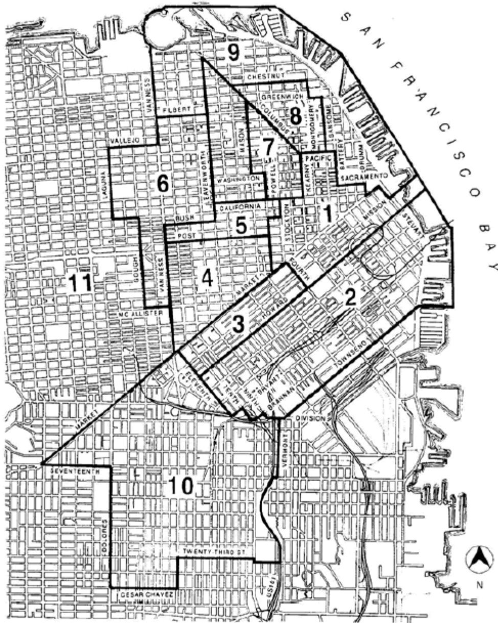
TABLE 4A-A 5B-A – PROGRAM IMPLEMENTATION SCHEDULE 1,2