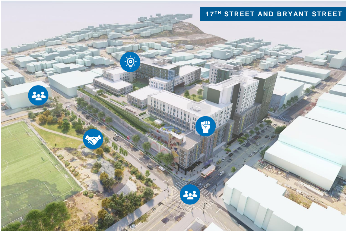
Conceptual rendering, not final design