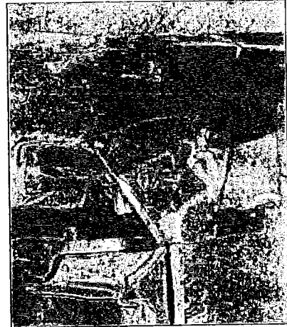
Richard Diebenkorn, Berkeley #23, 1955 ; oil on canvas; Collection SFMOMA, gift of the Women's Board; © Estate of Richard Diebenkorn