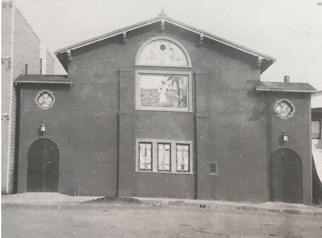
St. James Presbyterian Church, 240 Leland Avenue, circa 1925