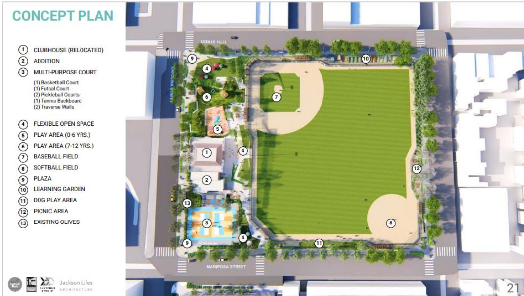
EXHIBIT A CONCEPT DESIGN