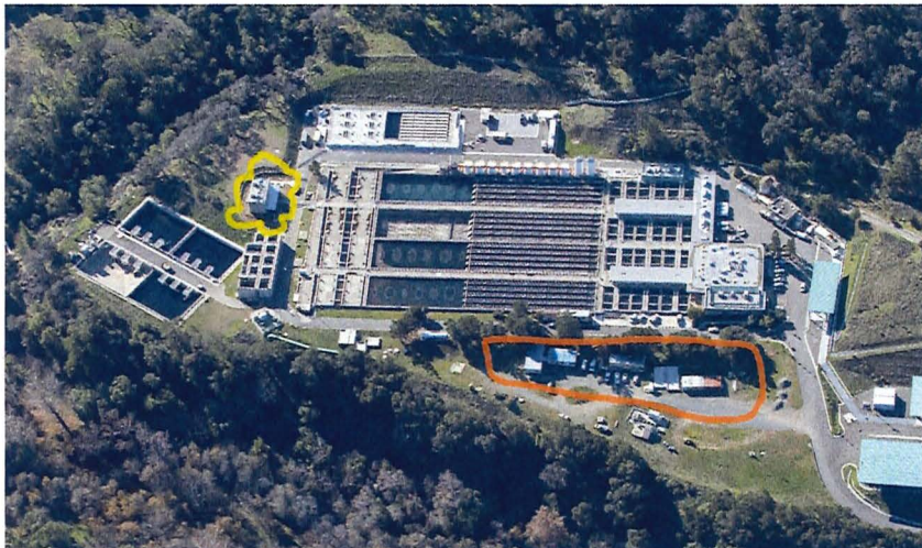
Sunol Valley Water Treatment Plant