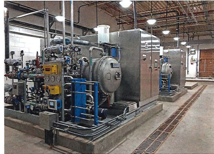
Ozone Generator System