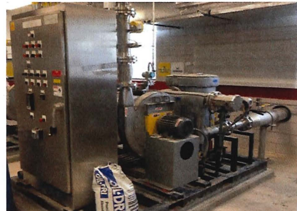
Ozone Destruct System