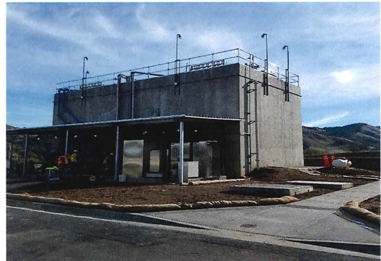
Powder Activated Carbon Facility