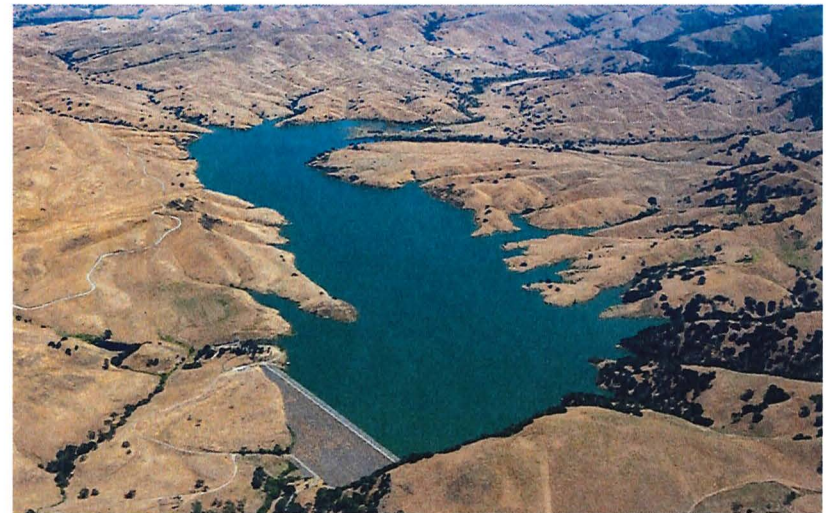
San Antonio Reservoir