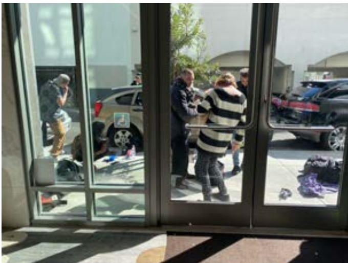
Home entrances are blocked by drug users and dealers.