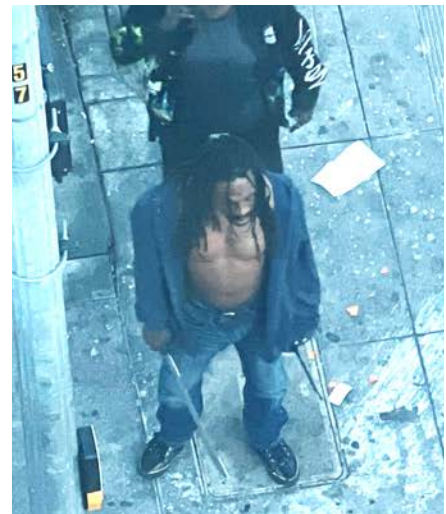
Man wields machete outside the Americana.