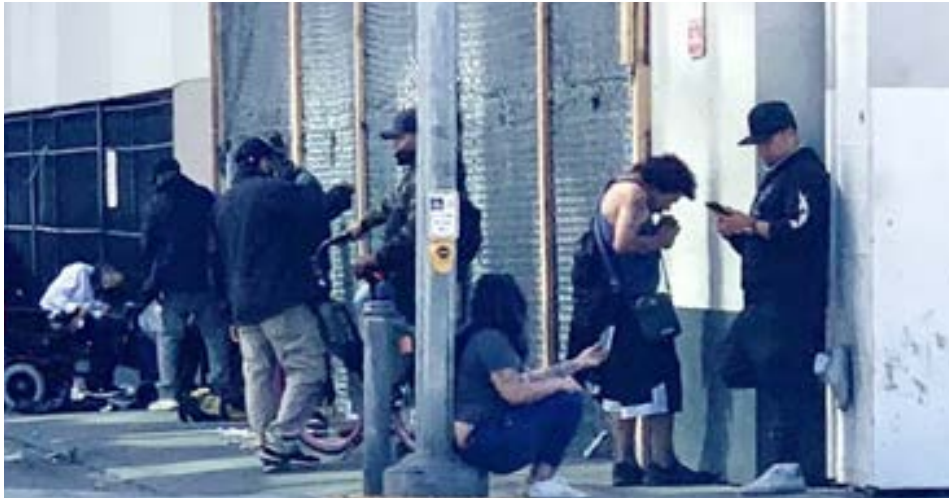
Dense hordes of drug dealers and users monopolize sidewalks on Mission and Minna at 7 th Street; regular meals are delivered to the dealers at their posts so there is little down time for the illegal activity.