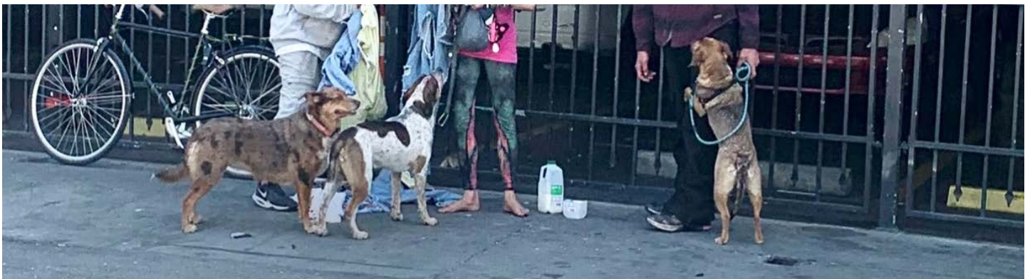
Off leash and unmuzzled dogs belonging to drug users intimidate and attack pedestrians.