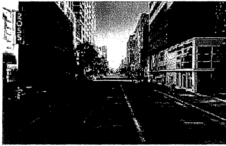
10 4th St San Francisco, CA 94103