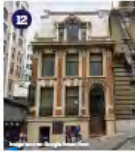
12 George Perine House 550 Powell Street Year Built: 1910 Significant as a rare and very late example of a second empire style house and as the only structure left downtown built as a single-family residence