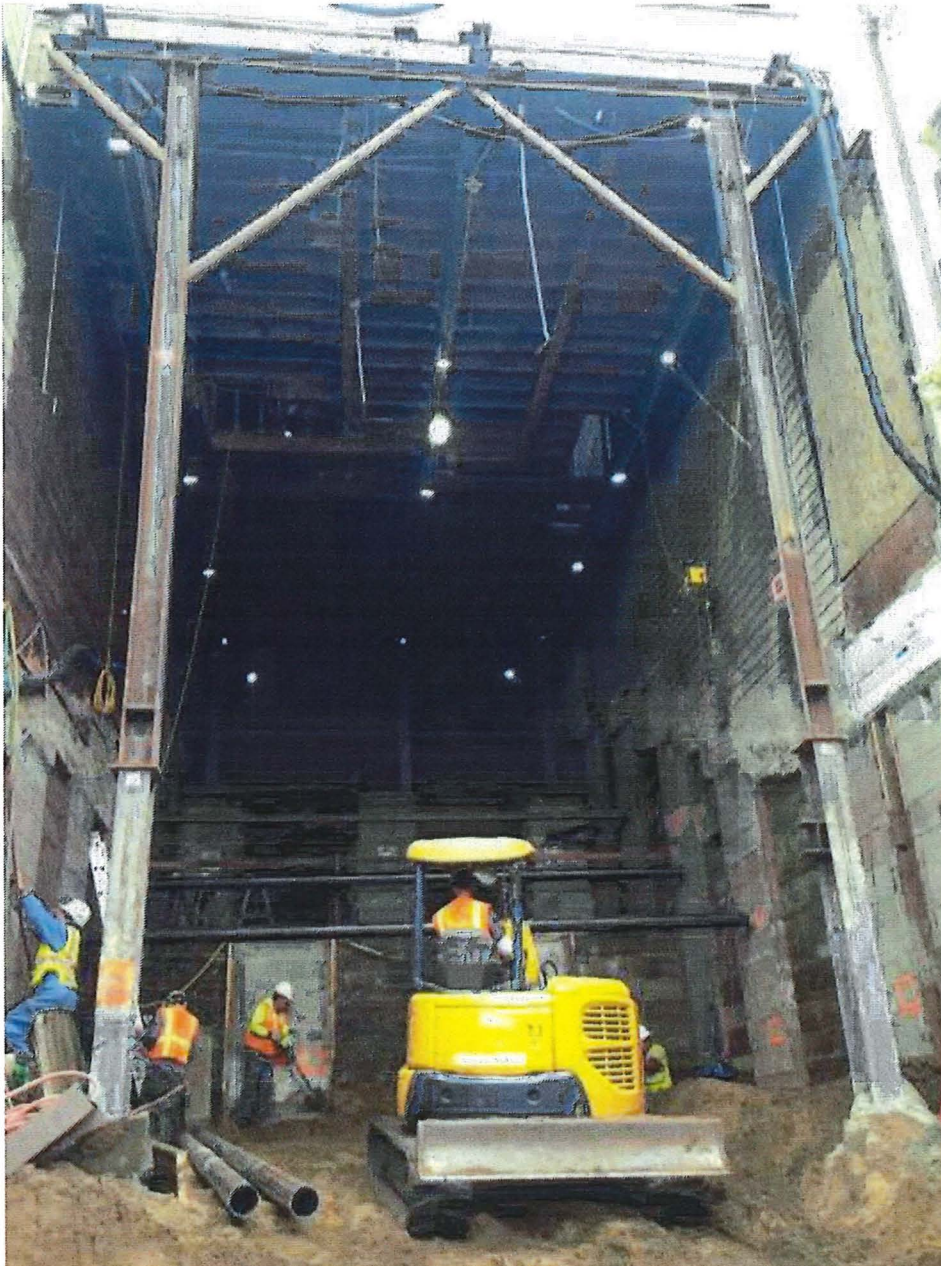
Figure 9 - 2833 Vallejo St - Hand dug pits and internal bracing