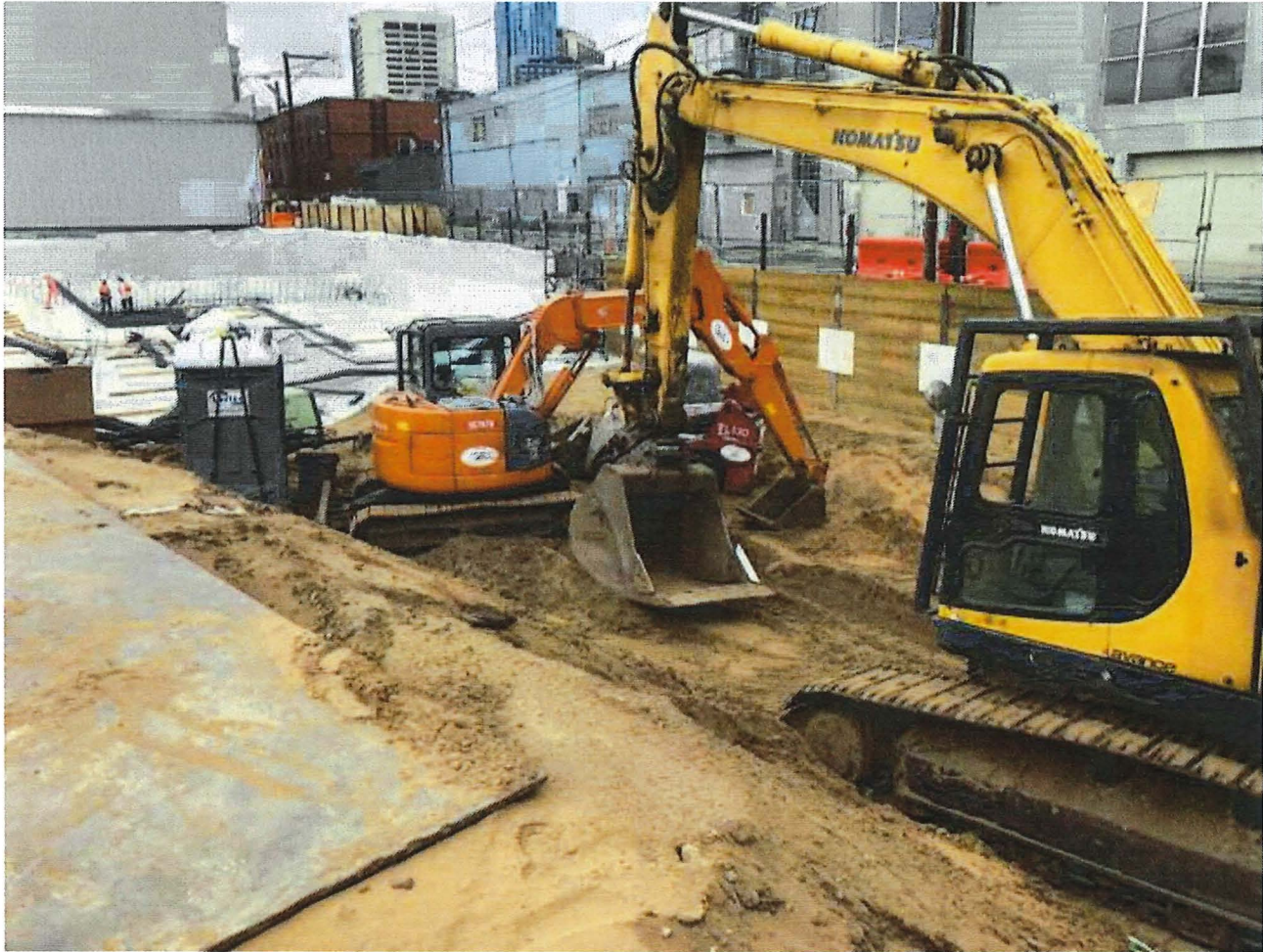
Figure 3 333 12th Street Conventional Equipment (Demolition, Excavation and shoring 20,000 CY)