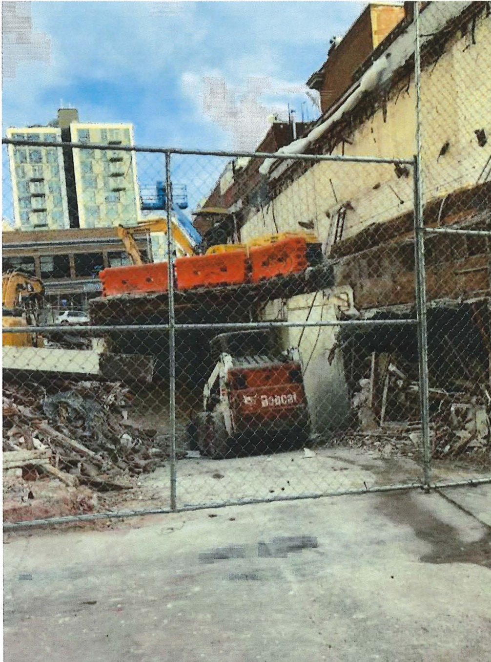
Figure 7 1433 Bush Street Demolition using small tools