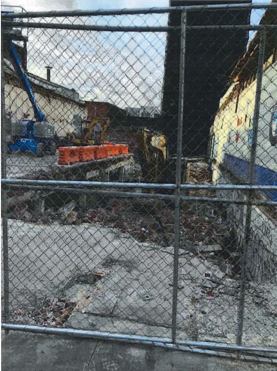
Figure 6 1433 Bush Street Demolition, Excavation and shoring 6,000 CY