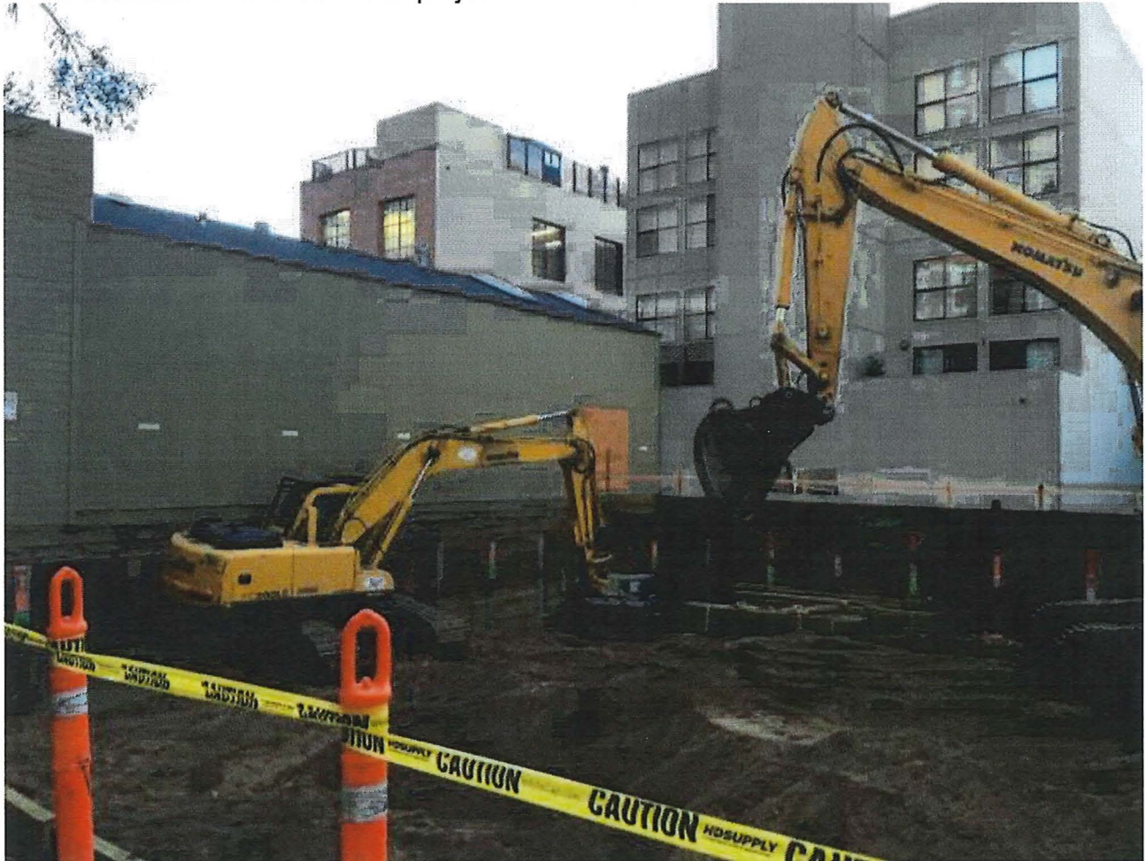
Figure 1 915 Minna excavation using conventional equipment (Demolition, Excavation and shoring 5,000CY)

Small Selection of 2017 and 2018 projects