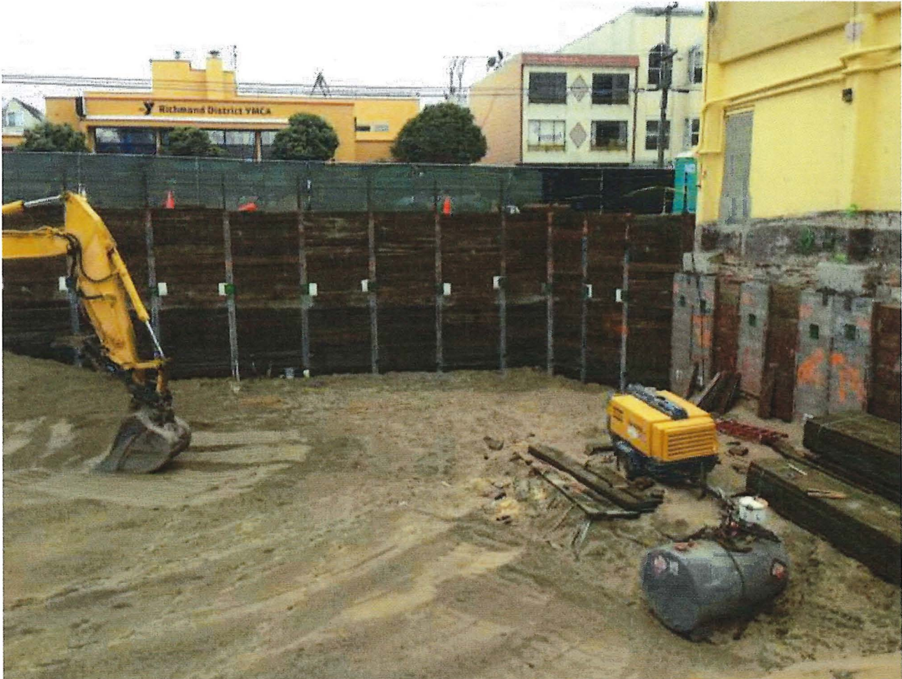
Figure 8 1810 8th Ave - 30,000 CY of sand. All compaction done with water and excavator. No vibratory rollers. Note hand dug pits.