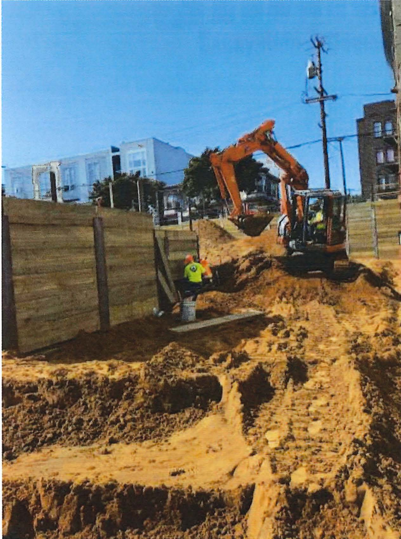
Figure 4 333 12th Street Conventional Equipment (Demolition, Excavation and shoring 20,000 CY)