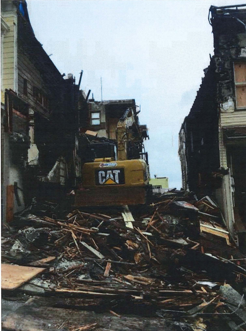
Figure 2 Hattie Street Demolition using excavator with no hoe-ram (Demolition, Excavation and shoring 2,000 CY)