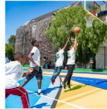
Highest- and Lowest-Scoring Parks