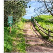
Changes in Park Scores Over Time