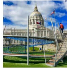
Citywide Park Score

Click on the topic you are interested in learning more about: