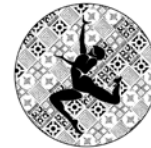
AFRICAN AMERICAN ART & CULTURE COMPLEX