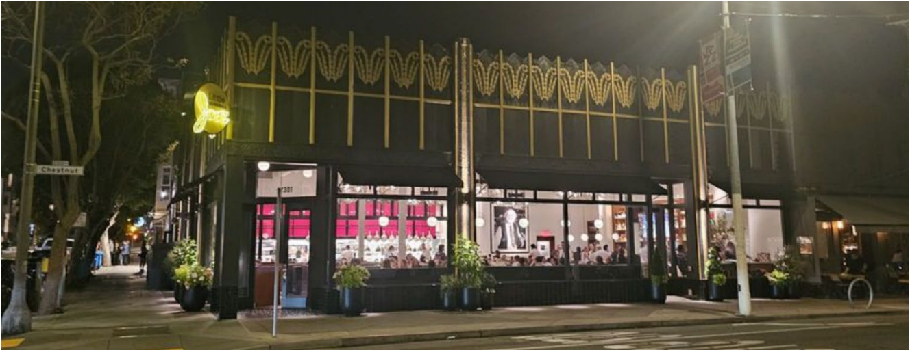
The corner business at 2301 Chestnut Street.

The building at 2301 Chestnut Street contains three commercial units. A full-service restaurant occupies the corner unit, while another full-service restaurant is in the center unit. The westernmost unit is occupied by a small grocery store. In February 2024, the restaurant on the corner applied for a permit to install an additional projecting sign at a secondary entrance on Chestnut Street. Although the business already has a projecting sign at the main corner entrance, it wanted to direct patrons to the bar side of the establishment through the secondary entrance. The sign permit is on hold pending legislative approval.