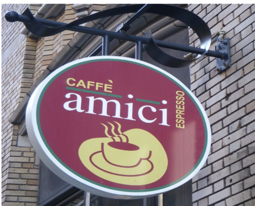
Example of a projecting Sign.