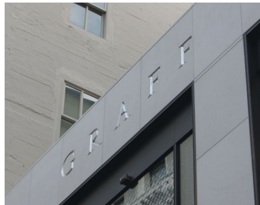
Two examples of Wall Signs.