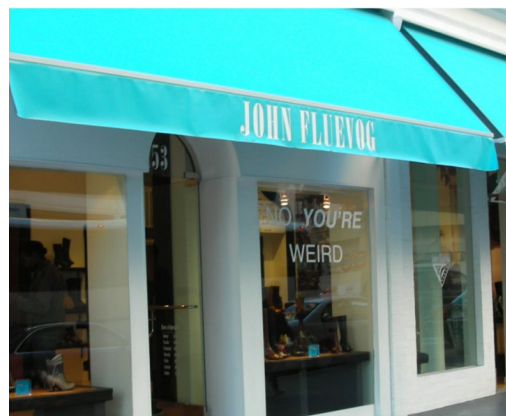
Example of a Sign on an Awning.