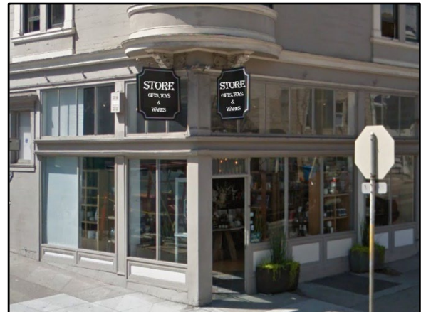
Two existing projecting signs at corner commercial units.