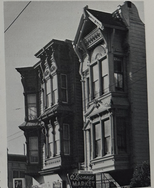
588 Haight Street

588 (1884) An exuberance of detail is played across the top two floors of this Stick Style house. A grocery store takes up the ground floor.