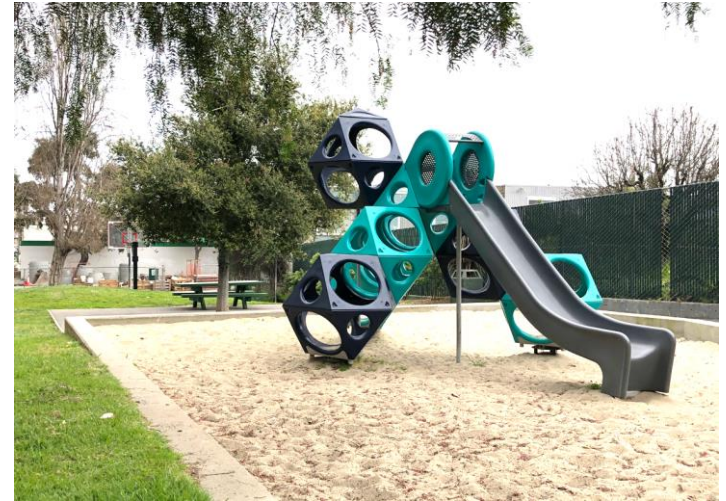
Selby Palou Mini Park