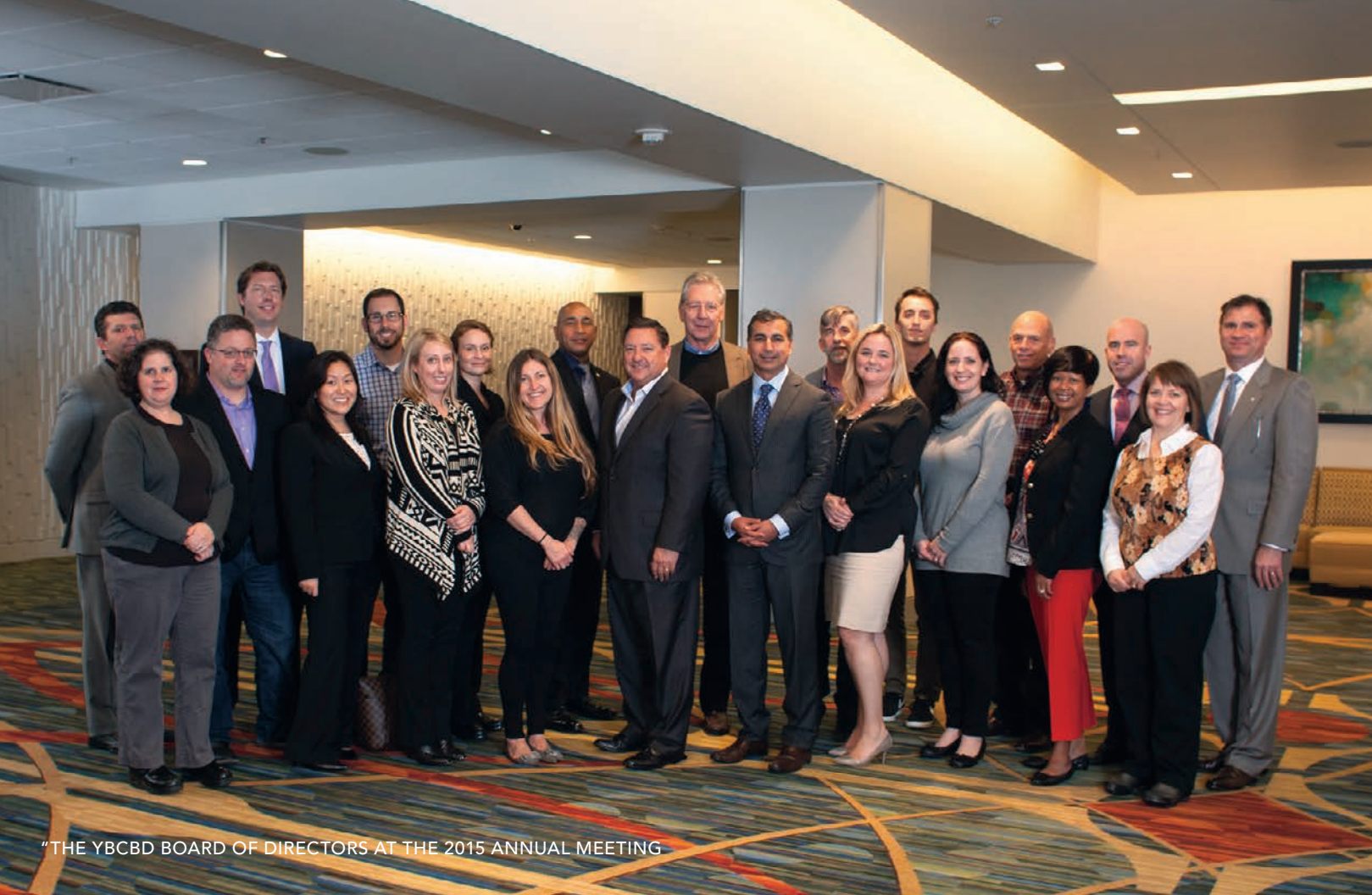
"THE YCBCD BOARD OF DIRECTORS AT THE 2015 ANNUAL MEETING"