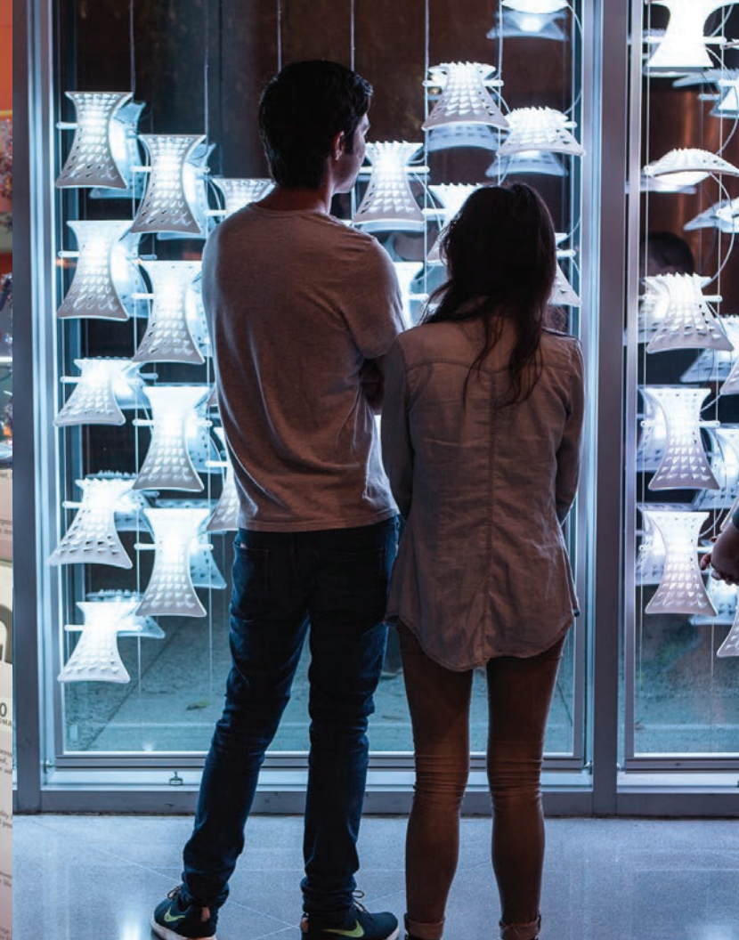
COMMUNITY BENEFIT FUND GRANTEES.