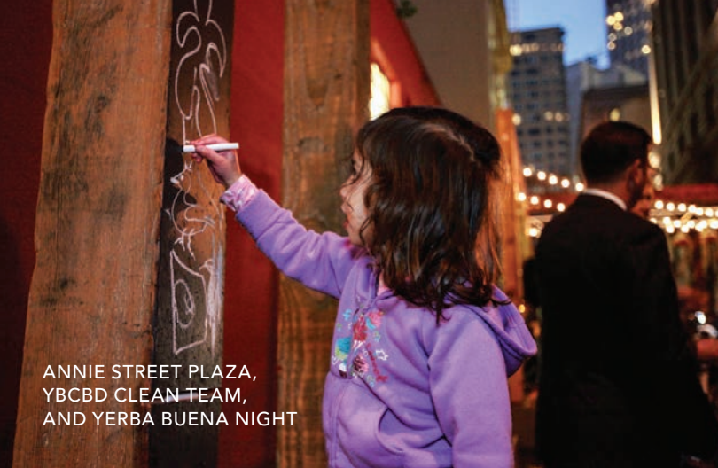
ANNIE STREET PLAZA, YBCBD CLEAN TEAM, AND YERBA BUENA NIGHT