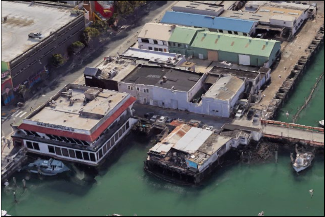
Figure 1 - 2019