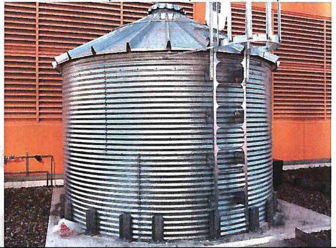
Rainwater cistern (Van Ness Ave, San Francisco)

Rainwater Harvesting: Cisterns that collect roof runoff and provide water for indoor or outdoor use.