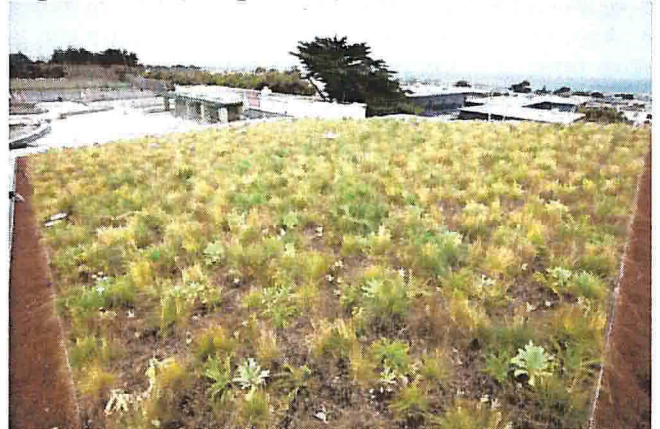
Vegetated roof (Ortega Library, San Francisco)

Rainwater Harvesting: Cisterns that collect roof runoff and provide water for indoor or outdoor use.