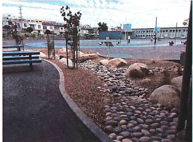
Downspout flowing into infiltration trench (RL Stevenson Elementary, San Francisco)

Infiltration Trench/Gallery: An unvegetated, rock-filled trench that receives surface stormwater runoff and allows it to infiltrate.